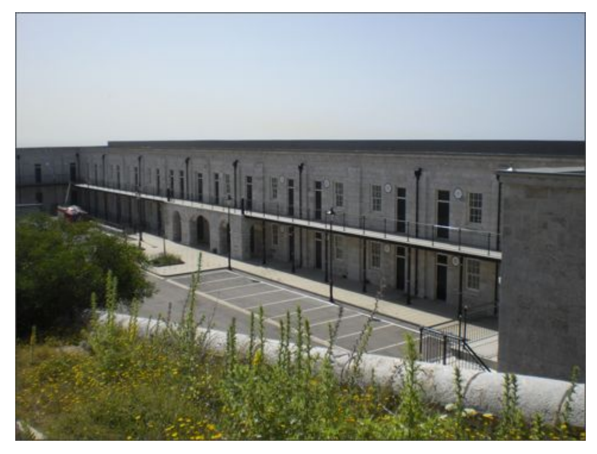
Lime stone retrenchment block restored to former glory.