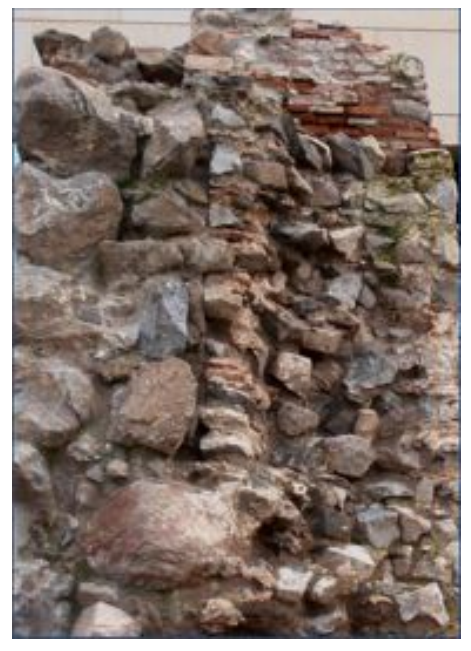
Typical random rubble wall.

New modern steel or concrete methods of construction are very similar to the UK and Europe. With cavity construction, single skin blockwork with insulated EPS systems and metal / timber decks. Some external clad systems have been used on various projects though luckily none affected by the Grenfell tower disaster. Traditional masonry methods tend to be used where local trained expertise from Spain and Portugal, are to hand.