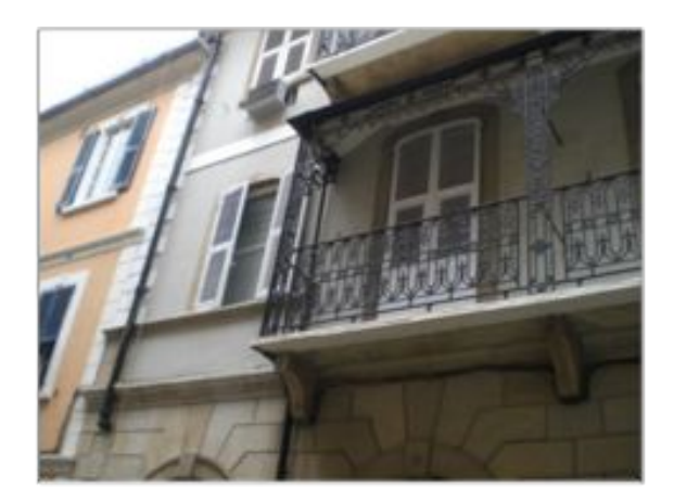
A typical facade with Genoese shutters..

The one feature common was the Genoese shutter – a typical timber shutter originating in northern Italy. This louvred shutter was highly efficient in keeping out the sun and maintaining an even temperature within. It also has a practical "spy panel" in the lower half that provides shade, increases airflow and ensures privacy from adjacent neighbours.