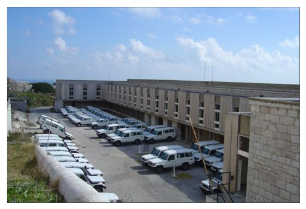
MOD building with 1960s prefab concrete corridor & office structure.