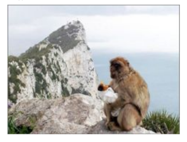
A Macaque taking lunch..usually someone else's!