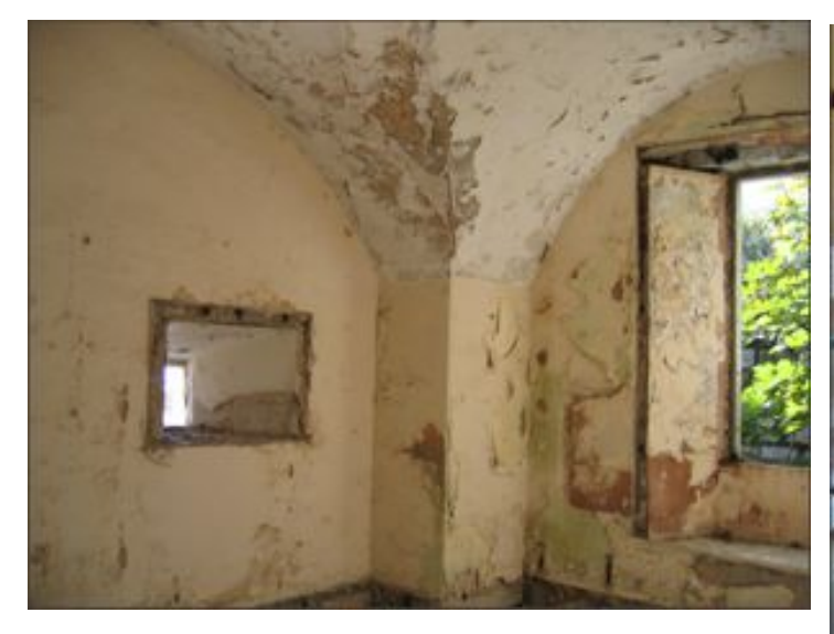
Internal vaulted rooms suffering from extensive damp and water ingress.

This forms only one small example of former military buildings, handed back to the Gibraltar Government, and given a new lease of life.