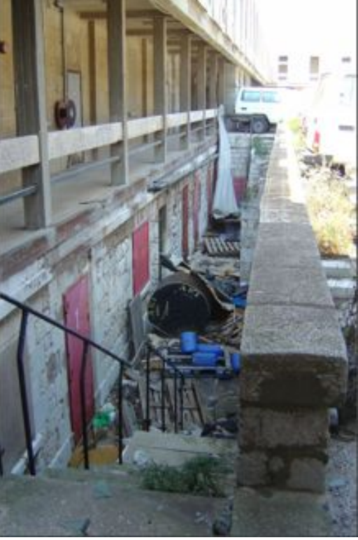
Before the works commenced